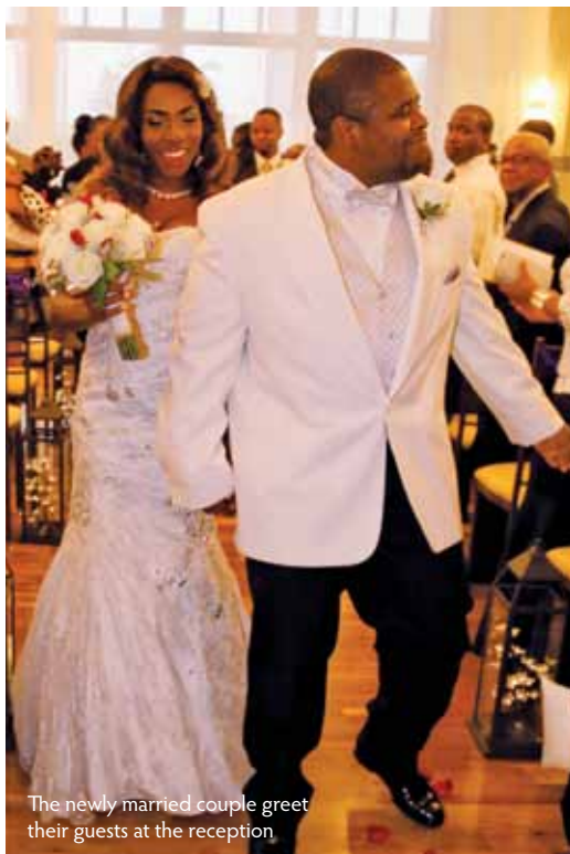
The newly married couple greet their guests at the reception.